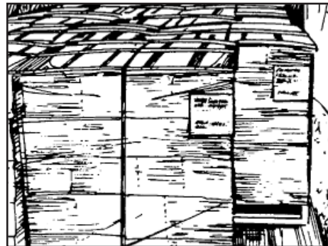
Good truck loading.