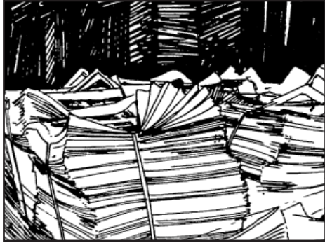
Banding individual lifts can cause product damage and create hopper feeding problems.