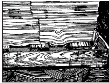
Improperly constructed pallets break apart during shipping and handling, causing preprint damage.