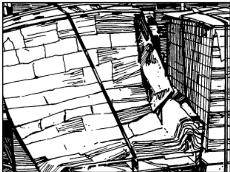
Damage caused by improper binding and poor truck loading.