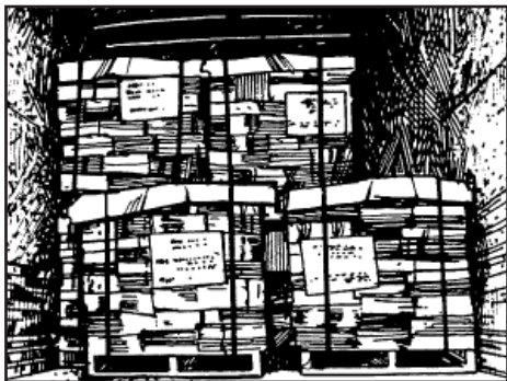
Loads must not be double-stacked on trucks as many newspapers do not have necessary equipment for unloading stacked product.