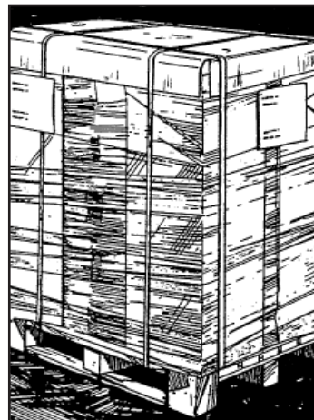
A well packed pallet.

Illustrations courtesy of the Research & Engineering Council of the Graphic Arts Industry, Inc. The complete Guide to Pallet Loading for Newspaper Insert Material can be obtained by contacting the R & E Council at 804-436-9922, or logging onto www.recouncil.org .